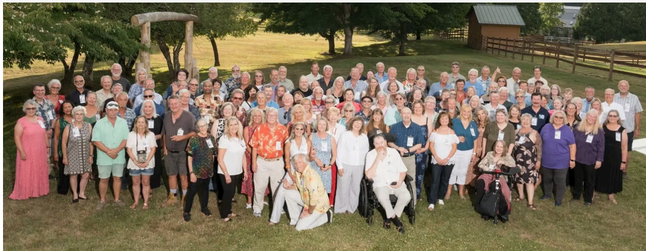
Mt. Rainier High School Class of 1974: August 2024